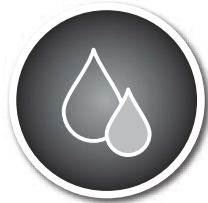
Fill with water