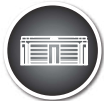
Put in place