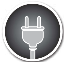
Plug in 120V (convertible 240V)