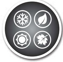
4 seasons insulation